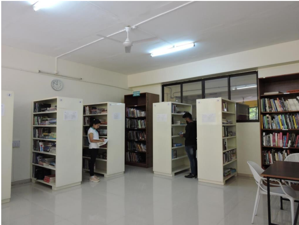
Library Reading Hall